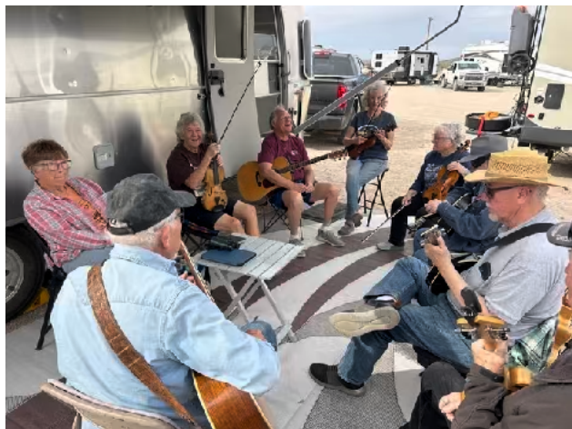
Ajo Campground Jam