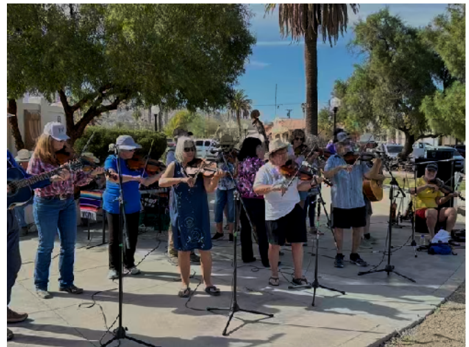
Fiddlers at Yuma Plaza